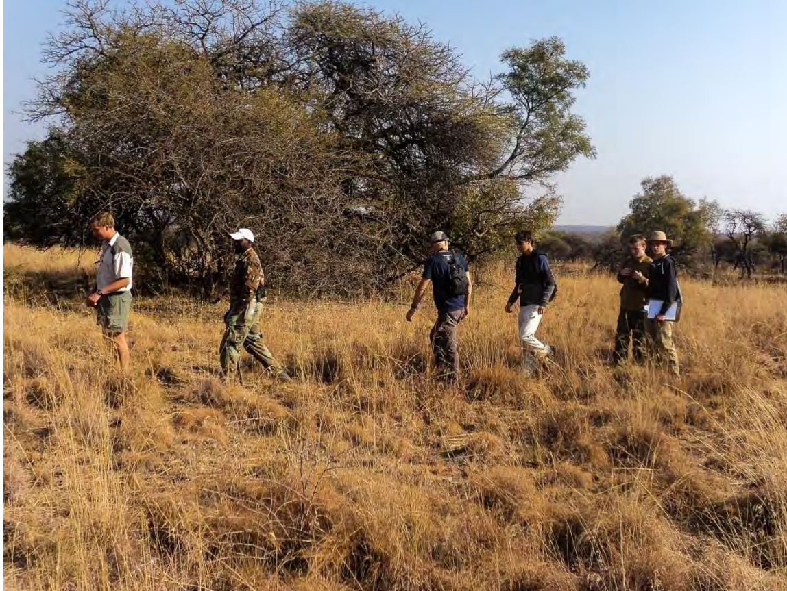
Optional bush treks