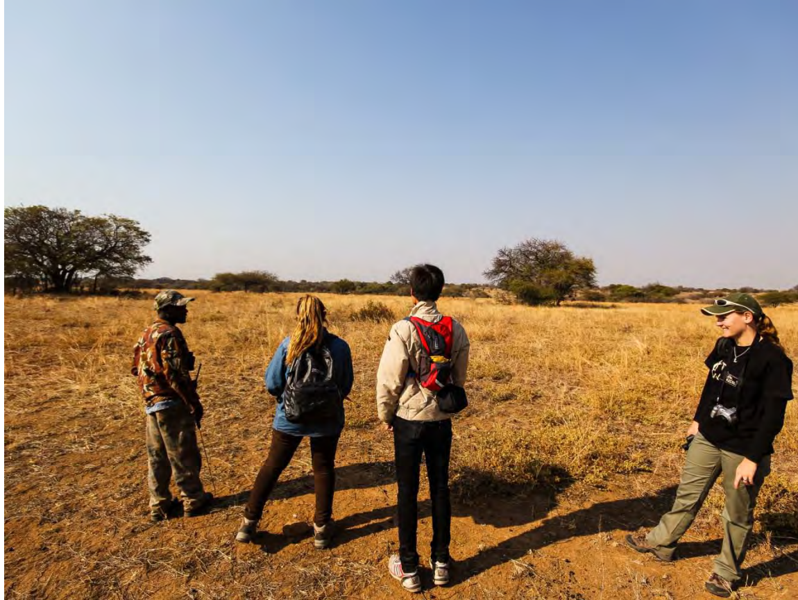
Anti Poaching Patrol