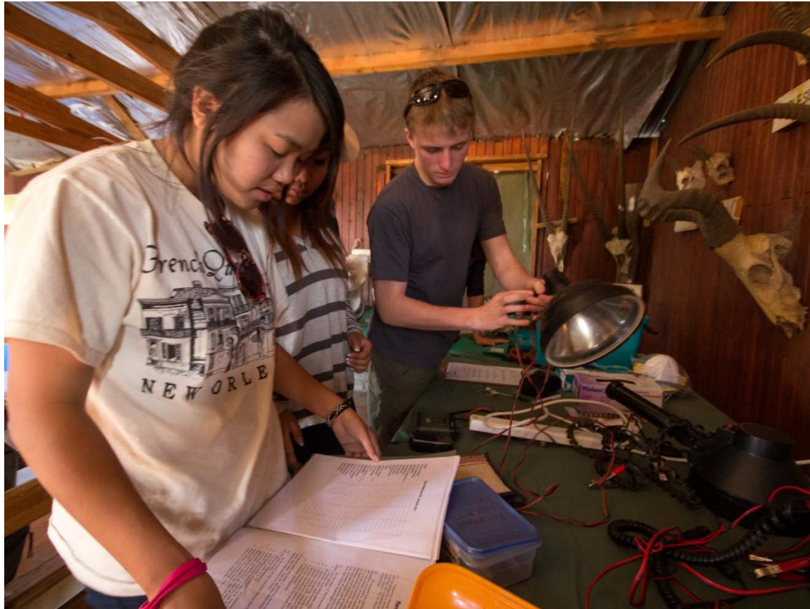
Organizing our drive kits.....