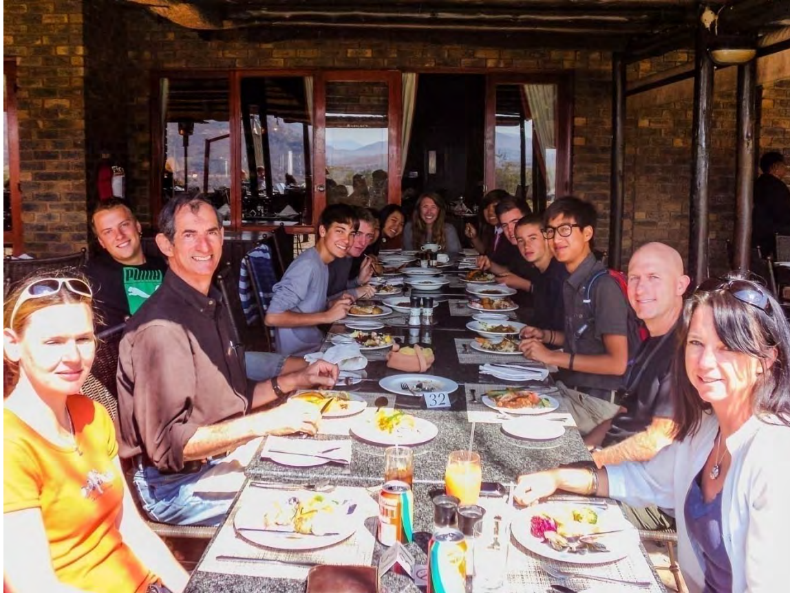
Day off at a Game Lodge