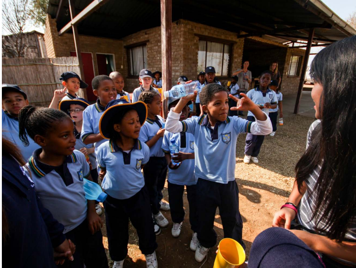
Conservation Day for a Local School